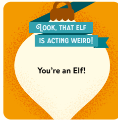
Role card, Elf version