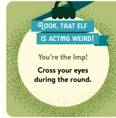
Role card, Imp version (with secret rule)