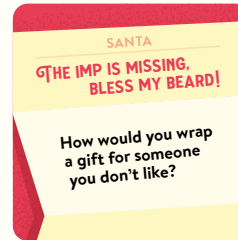
Santa card (red Christmas side)