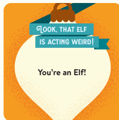
Role card, Elf version