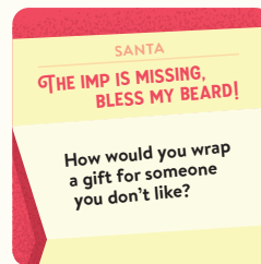
Santa card (red Christmas side)