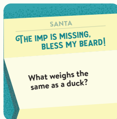
Santa card (blue year-round side)