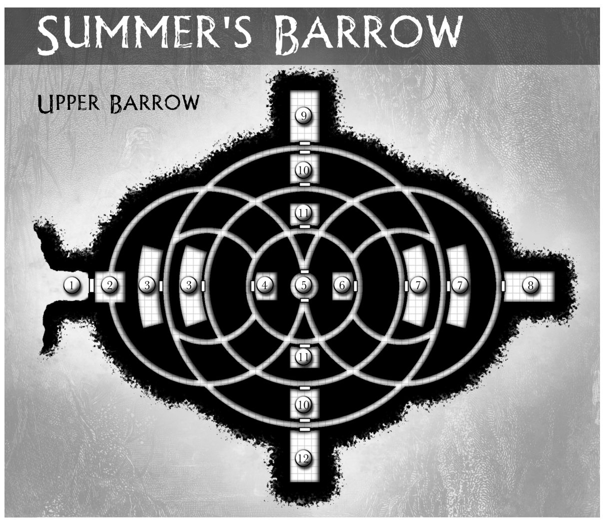
In the actual book, this map is just one half of a two-page spread!

Finally, we give some ideas for modifying the site so that it can play a different role in your campaign. The personalities and goals of the site's inhabitants might change drastically, or the site itself might be transformed. What if the residents are really the evil minions of some dark god, for instance, and not the kindly caretakers they would have the PCs think them? Maybe they're hiding a deeper agenda that only the player characters can discover. These are the kinds of variations that are suggested in this last section.